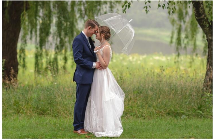
Capture the Moment

Couples may schedule any four-hour time block for a wedding ceremony. This time block may be anytime between the hours of 8 am to 9 pm. Weddings are not scheduled at Holy Wisdom Monastery during Holy Week, on Easter Day, Thanksgiving Day, Thanksgiving weekend and Christmas Eve through New Year's Day.