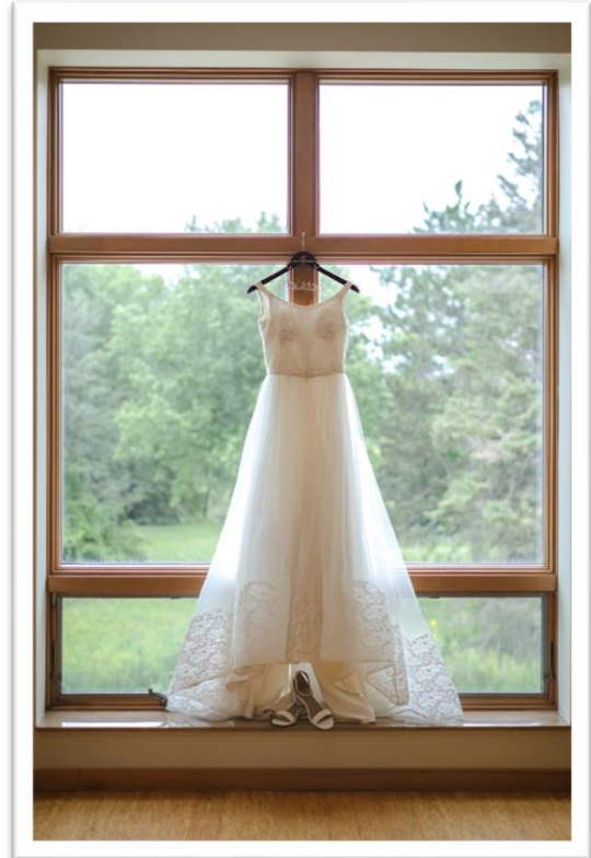
Capture the Moment by Kristel Stephany

We offer a wedding arch for use during outdoor weddings as a backdrop for the couple. Flowers or greens can be attached to the arch using twist ties or pipe cleaners. The rental fee for the arch is $155.