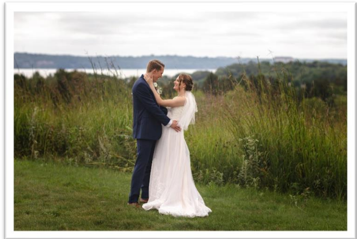
Capture the Moment by Kristel Stephany

If you find that a four-hour/8-hour time block is not enough time for your ceremony and/or reception, you may schedule additional time (non-refundable) at the rate of $146 per hour. If a wedding runs over the allotted time, the couple will be responsible for paying the additional time used, and this fee may be deducted from their damage deposit.