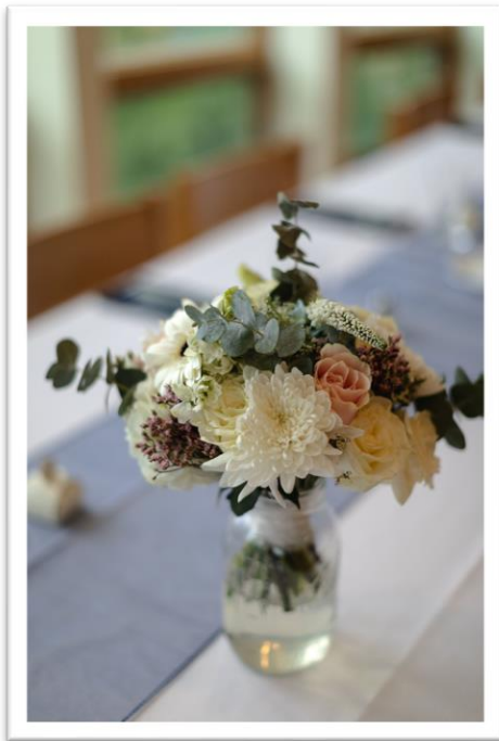
Capture the Moment

Holy Wisdom Monastery is the home and workplace of Benedictine Women of Madison, an ecumenical monastic community. The sisters welcome guests and encourage everyone to share in their life of prayer, hospitality, justice and care for the earth.