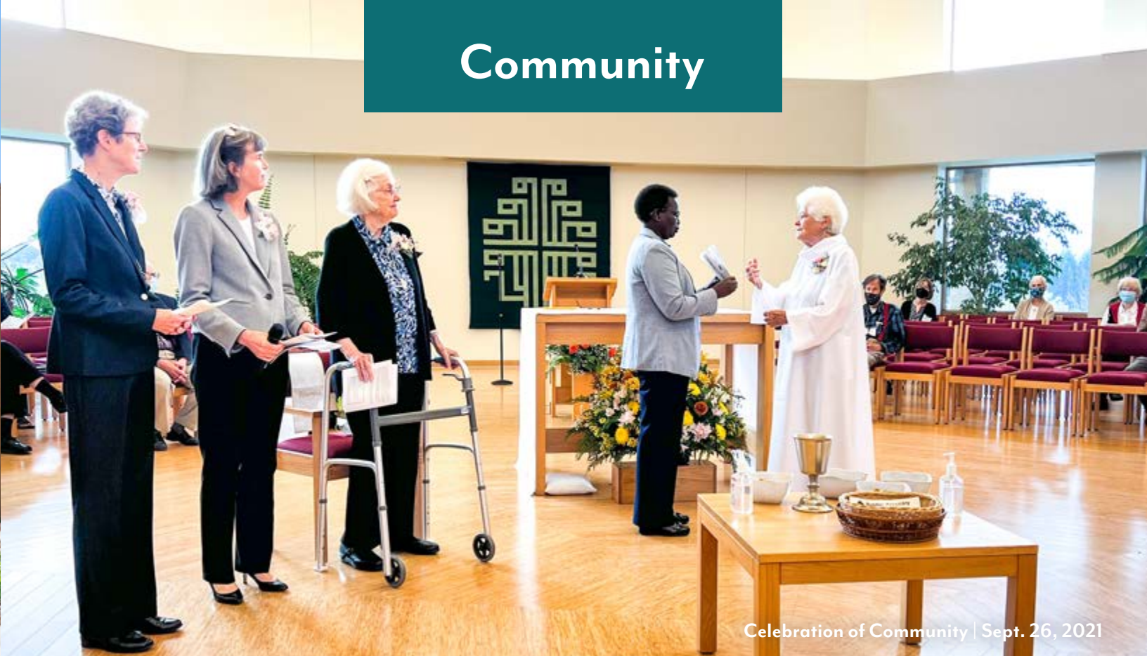
Celebration of Community | Sept. 26, 2021

BUILDING COMMUNITY Holy Wisdom Monastery is home to a vibrant community of communities. At the heart is Benedictine Women of Madison, the sisters' monastic community, open to Christian women of any denomination.