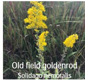
Old field goldenrod Solidago nemoralis