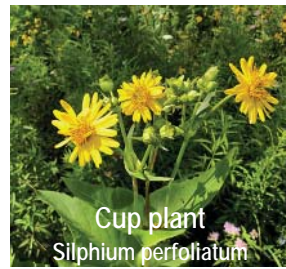
Cup plant Silphium perfoliatum