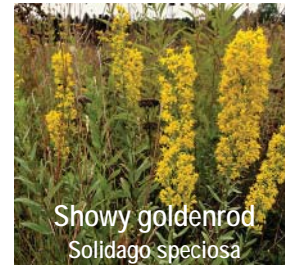
Showy goldenrod Solidago speciosa