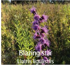
Blazing star Liatris ligulistilis