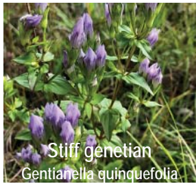
Stiff gentian Gentiana quinquefolia