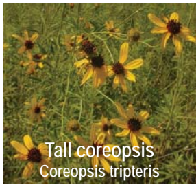
Tall coreopsis Coreopsis tripteris