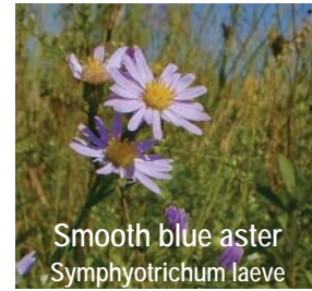
Smooth blue aster Symphyotrichum laeve