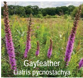
Gayfeather Liatris pycnostachya