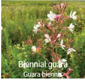
Biennial guara Guara biennis