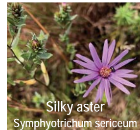
Silky aster Symphyotrichum sericeum