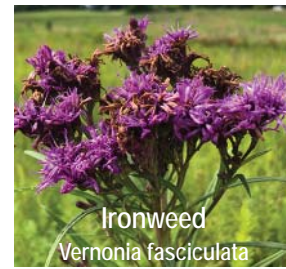
Ironweed Vernonia fasciculata