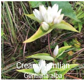
Creamy gentian Gentiana alba