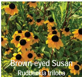
Brown-eyed Susan Rudbeckia triloba