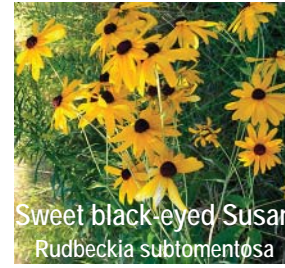
Sweet black-eyed Susan Rudbeckia subtomentosa

Flowering times can vary from year to year due to multiple environmental conditions