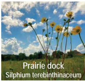
Prairie dock Silphium terebinthinaceum