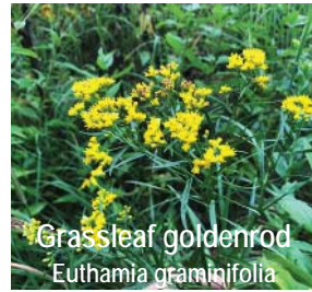
Grassleaf goldenrod Euthamia graminifolia