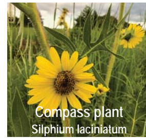
Compass plant Silphium laciniatum