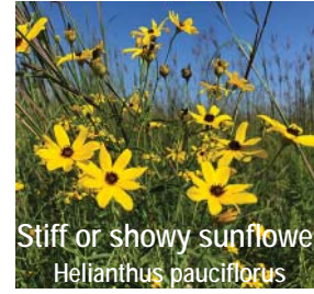
Stiff or showy sunflower Helianthus pauciflorus