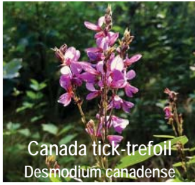
Canada tick-trefoil Desmodium canadense