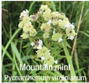
Mountain mint Pycnanthemum virginianum

A prairie is a community of flowers, grasses and sedges, with few trees or shrubs.