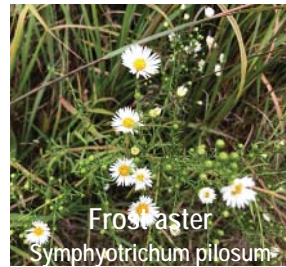
Frost aster Symphyotrichum pilosum