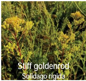
Stiff goldenrod Solidago rigida