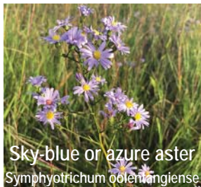
Sky-blue or azure aster Symphyotrichum oolentangiense