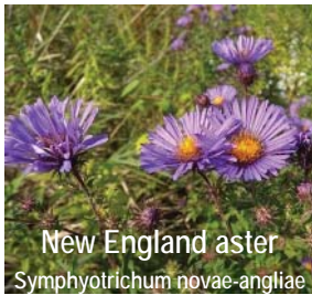
New England aster Symphyotrichum novae-angliae