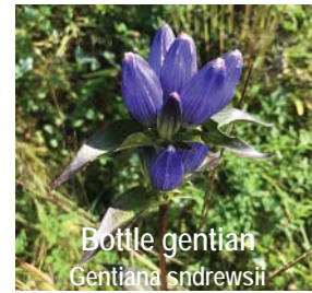
Bottle gentian Gentiana andrewsii

Deep root systems of prairie plants protect topsoil and prevent erosion.