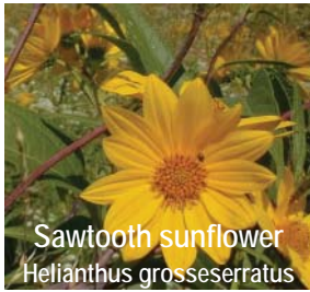
Sawtooth sunflower Helianthus grosseserratus